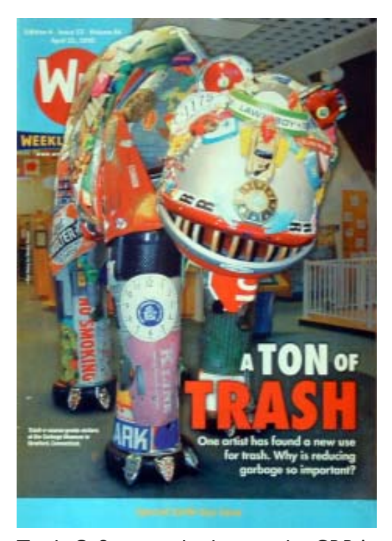
Trash-O-Saurus, who lives at the CRRA Garbage Museum in Stratford, helps teach people how to responsibly manage their trash. CRRA believes the state will need extensive education programs to help reach its recycling goals.

Further, the capacity crunch will be exacerbated in the next few years as beneficial ownership of most of the state's trash-to-energy plants passes to their private-sector operators. After Wheelabrator takes control of the Bridgeport plant in 2009 and after Covanta takes control of the Wallingford (2010), Bristol (2014) and Preston plants (2015), those plants will not necessarily be available to continue to process just in-state trash. In the near future the CRRA-owned Mid-Connecticut Project plant may be the only publicly-owned waste disposal facility left in the state.