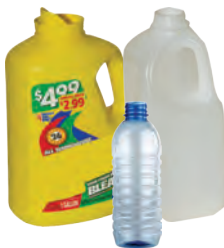
All #1-#2 plastic containers under 3 gallons