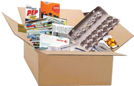
Newspapers & inserts, magazines, junk mail, catalogs, white & colored paper, computer paper, cereal boxes, shoe boxes, paper egg cartons, corrugated cardboard