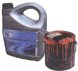
Motor oil, antifreeze, paint or any other hazardous material containers