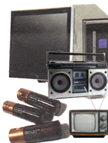
Batteries or electronics