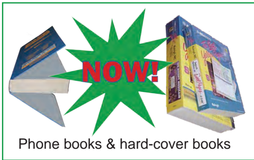
Phone books & hard-cover books