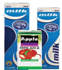
Milk & juice cartons, juice boxes