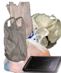
Plastic bags, anything made of black plastics