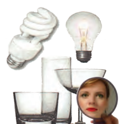
Mirrors, windows, light bulbs or drinking glasses