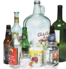
Glass food & beverage jars, bottles & jugs