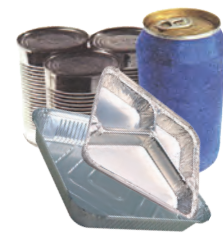
Steel, tin & aluminum food trays, foil & cans