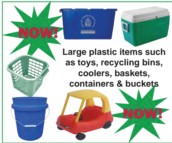
Large plastic items such as toys, recycling bins, coolers, baskets, containers & buckets