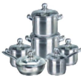
Metal, ceramic & glass pots & pans, scrap metal, pottery