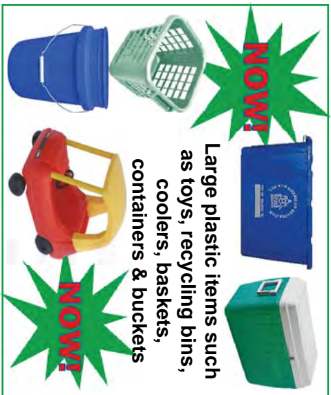
Large plastic items such as toys, recycling bins, coolers, baskets, containers & buckets