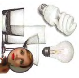
Mirrors, windows, light bulbs or drinking glasses