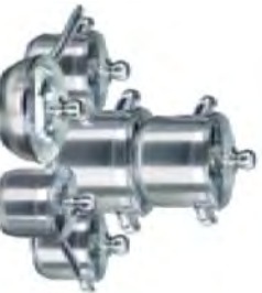
Metal, ceramic & glass pots & pans, scrap metal, pottery