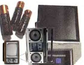
Batteries or electronics