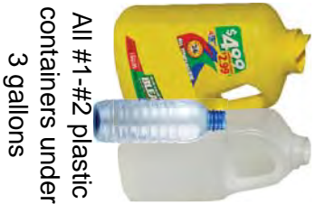
All #1-#2 plastic containers under 3 gallons

Newspapers & inserts, magazines, junk mail, catalogs, white & colored paper, computer paper, cereal boxes, shoe boxes, paper egg cartons, corrugated cardboard