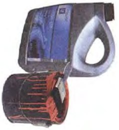
Motor oil, antifreeze, paint or any other hazardous material containers