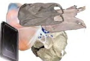
Plastic bags, black plastics