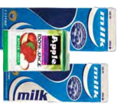
Milk & juice cartons, juice boxes