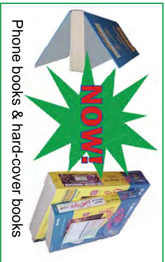
Phone books & hard-cover books