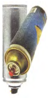
Empty aerosol cans (non-toxic)