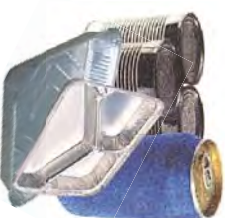
Steel, tin & aluminum food trays, foil & cans