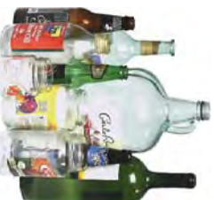
Glass food & beverage jars, bottles & jugs