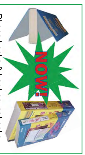
Phone books & hard-cover books